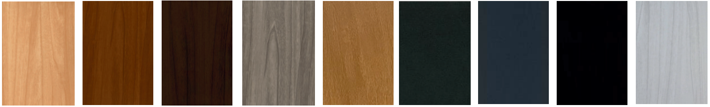
Natural Walnut (WU- 0384) Walnut (WU-0112) Dark Walnut (WU- 0497) Grey Walnut (WU-0201) Elmwood (WY-0870) Grey Brown (PL-0598) Anthracite Grey (PL-0668) Black (PL-0741) White Walnut (WU-0909)